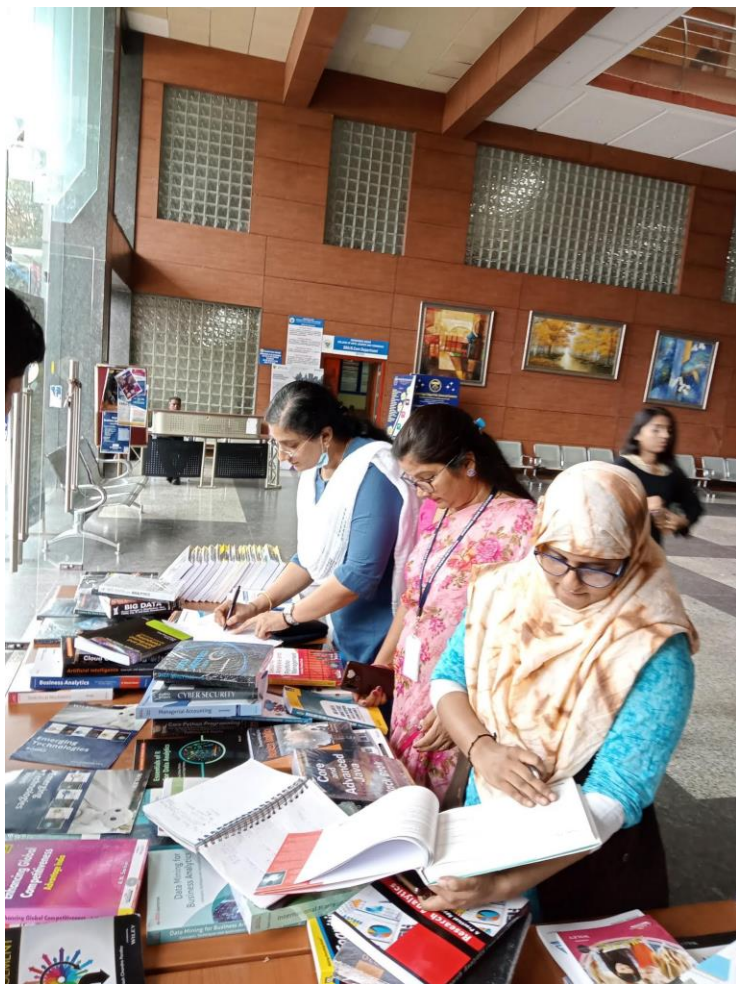
Faculty participated in the book exhibition