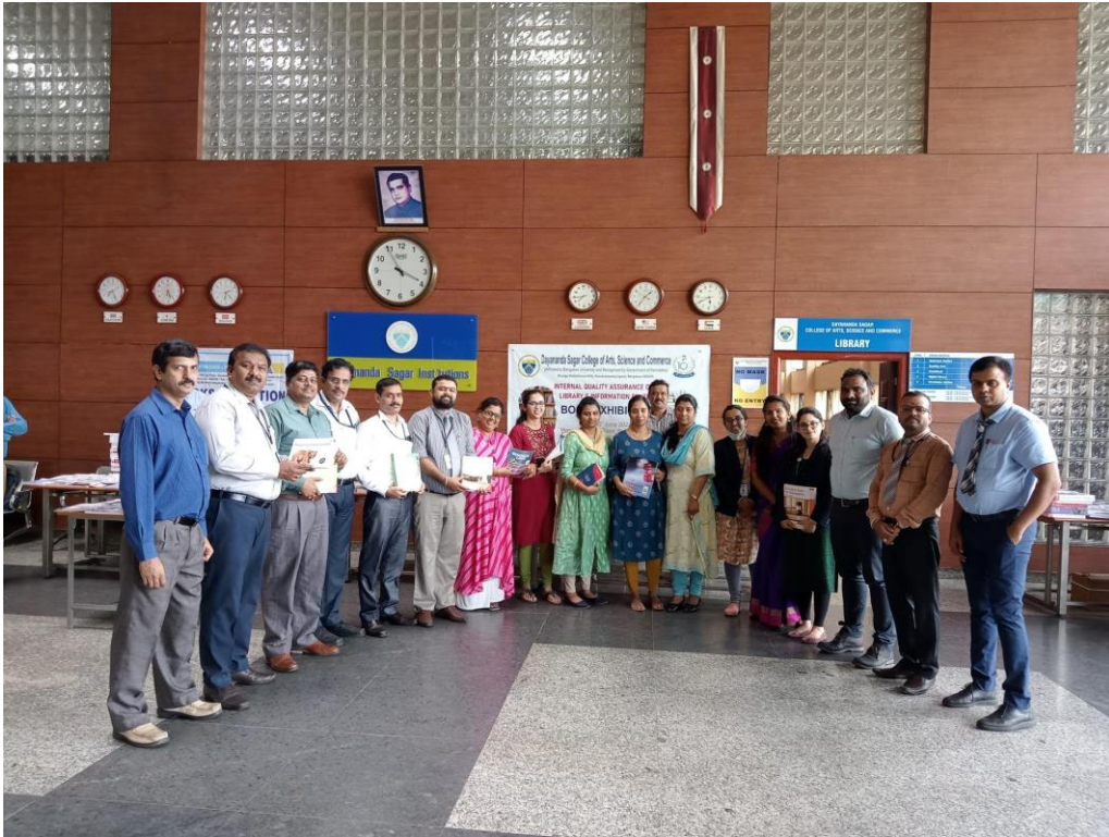
Faculty group Photo during the Books Exhibition