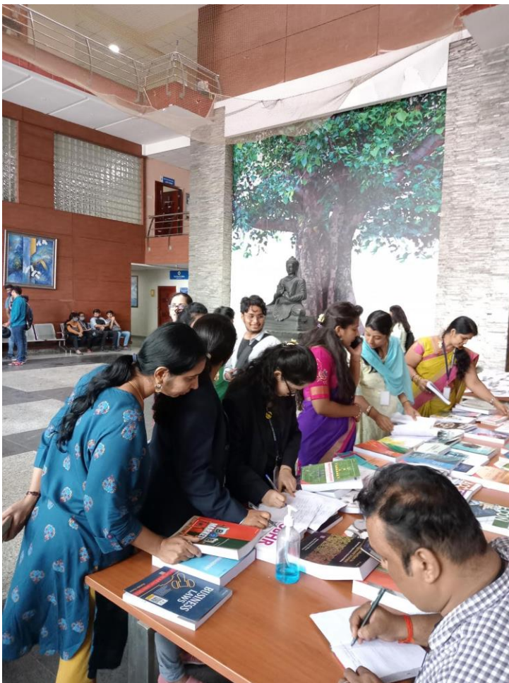
Faculty participated in the book exhibition