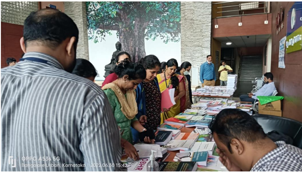
Staff members participated in the book exhibition