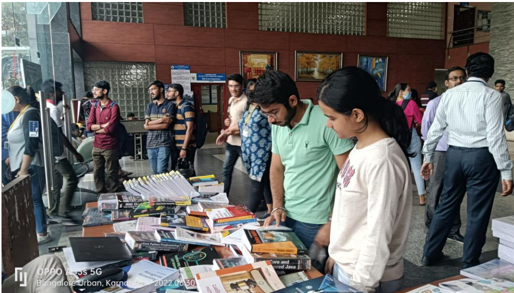
Students participated during the book exhibition